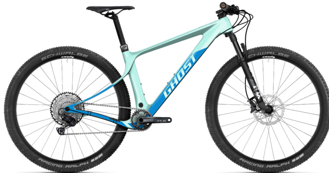
LECTOR SF ADVANCED