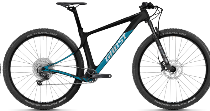
LECTOR SF ESSENTIAL