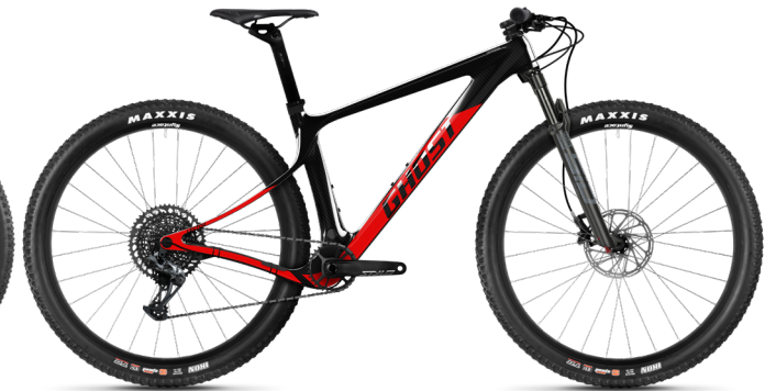
LECTOR SF UNIVERSAL